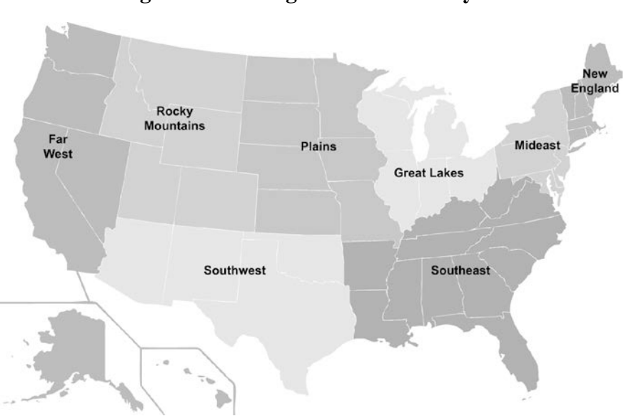
Figure 2. U.S. Regions as Defined by NCES

The NCES divides the United States into eight geographic regions. Of the U.S.-based institutions posting ads with the organizations, the majority were located in the Southeast, including these twelve states: Alabama, Arkansas, Florida, Georgia, Kentucky, Louisiana, Mississippi, North Carolina, South Carolina, Tennessee, Virginia, and West Virginia (Table 9). The Southeast, Mid East, and Great Lakes regions account for nearly two-thirds of the ads posted by U.S. institutions (63.8%).