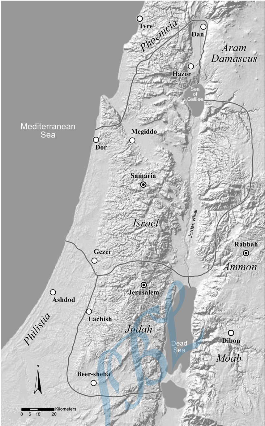
Figure 1. Map of Israel and Judah in the eighth century B.C.E.