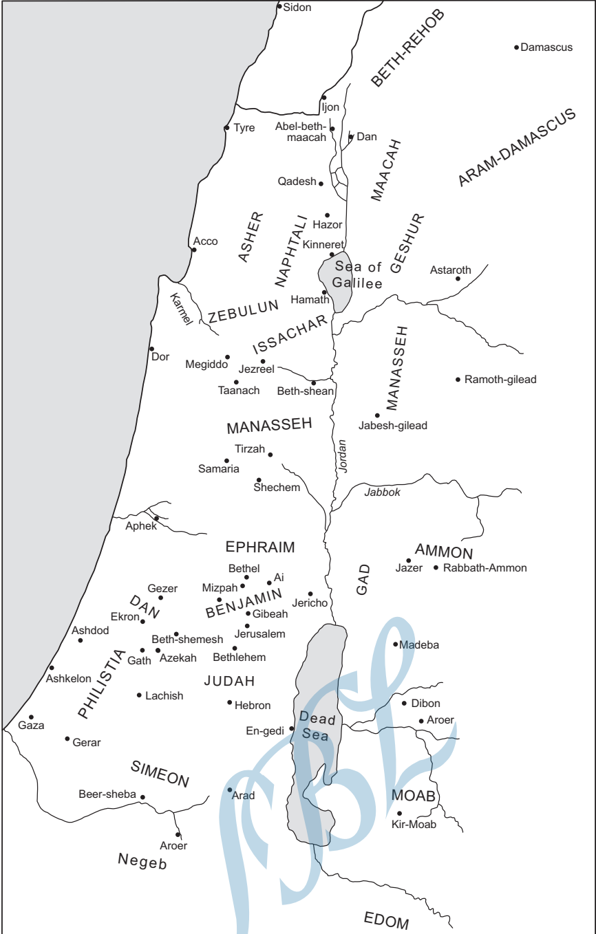
Palestine in the Iron Age