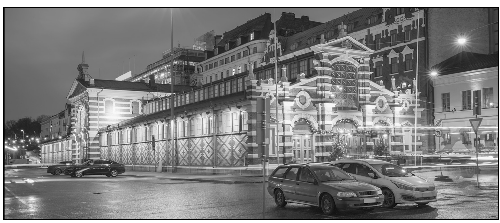
Old Market Hall Vanha Kauppahalli In City Center in Helsinki, Finland

All meeting registrants are warmly welcome to attend this opening reception, hosted by the City of Helsinki. The reception includes a salad buffet, wine, and refreshments. Vegan option is available. The location of the reception, the City Hall is a 5 minute walk from the University Main Building.