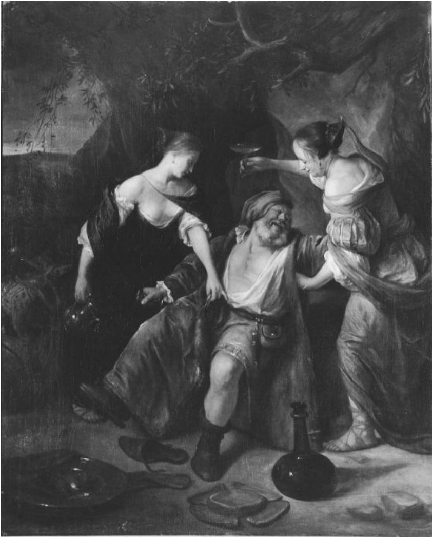
Figure 5.1. Jan Steen, Lot und seine Töchter , Wessenberg-Galerie, Konstanz.

In Jan Steen's Lot und seine Töchter , painted in 1665, Lot, looking like a jolly middle-class country landowner, is the central figure, with what appears to be his elder daughter on his left and his younger daughter on his right (Figure 5.1). The warm, soft tones of the painting lend an erotic atmosphere and suggest the intimacy of the cave, as if it were dimly lit by a fire. We might view this scene as the beginning of the 'seduction', for Lot is still sitting