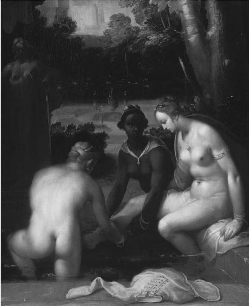
Figure 1.3. Cornelis Cornelisz van Haarlem, Het toilet van Bathseba , Rijksmuseum, Amsterdam.

painting is a study in contrasts. Everything is dark or bright. Bathsheba's body and her servant's back, the blue cloth around the other servant's neck, the yellow robe in the foreground, the area around the tree, and the castle are bathed in light, whereas everything else is dark and difficult to distinguish. Light links the castle, and through metonymy David, with the Edenic tree and Bathsheba, the forbidden fruit.