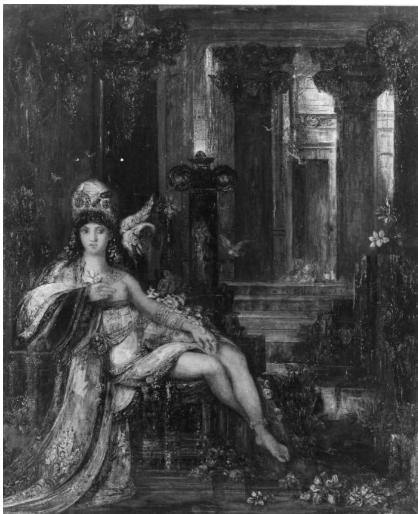
Figure 7.1. Gustave Moreau, Delilah , Museo de Arte de Ponce, Puerto Rico.