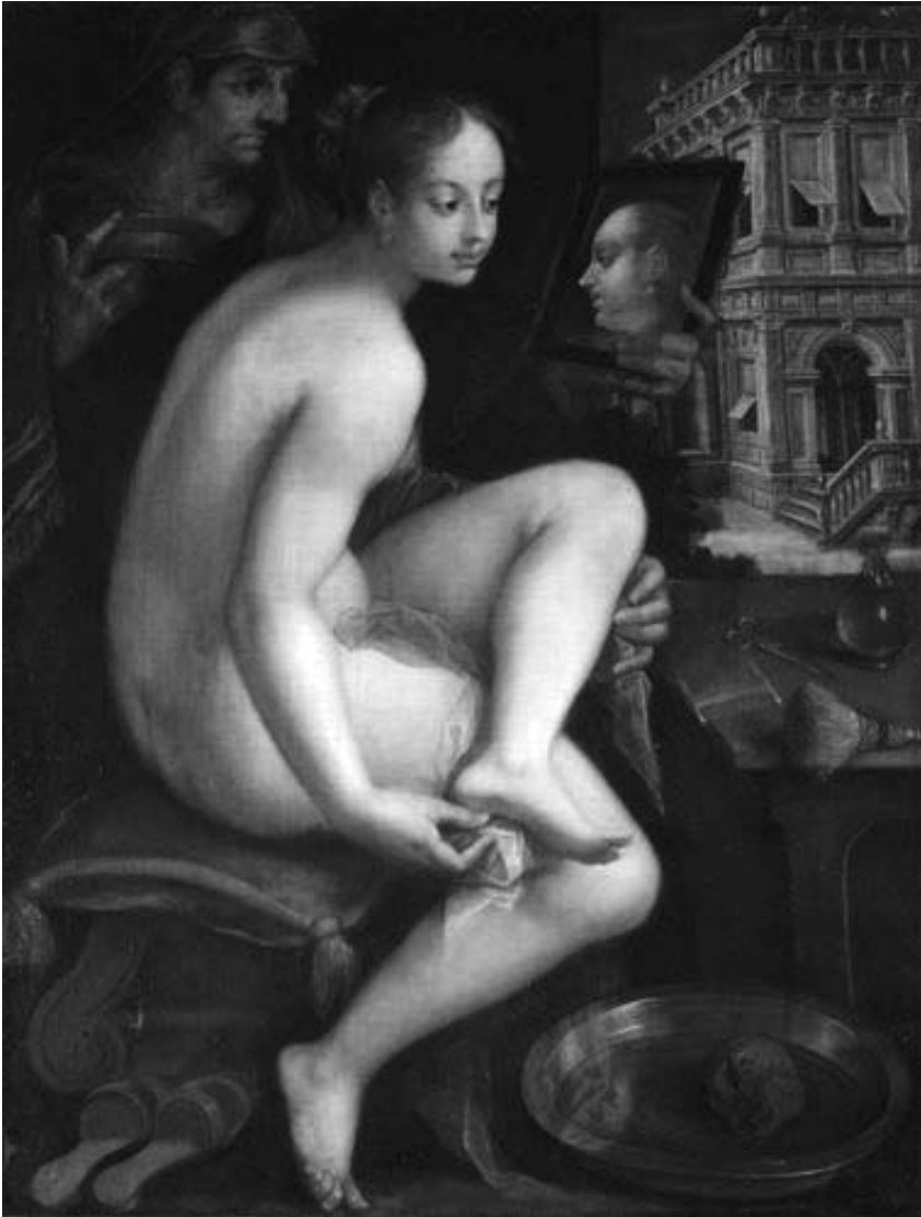
Figure 1.6. Hans von Aachen, David und Bathseba , Kunsthistorisches Museum, Vienna.