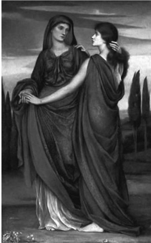
Figure 6.6. Evelyn de Morgan, Ruth and Naomi .

interest. Romanticizing readings find more in Ruth and Boaz's relationship than a kinsman's willingness to take responsibility for the welfare of two needy female relatives, or the juridical issue of redemption, or the obligation of a kinsman to perpetuate his relative's family and 'the name of the dead in his inheritance' (4.10), 53 or even a model for living according to the dictates of hesed . 54 They find feelings . They probe into characters' emotions that the