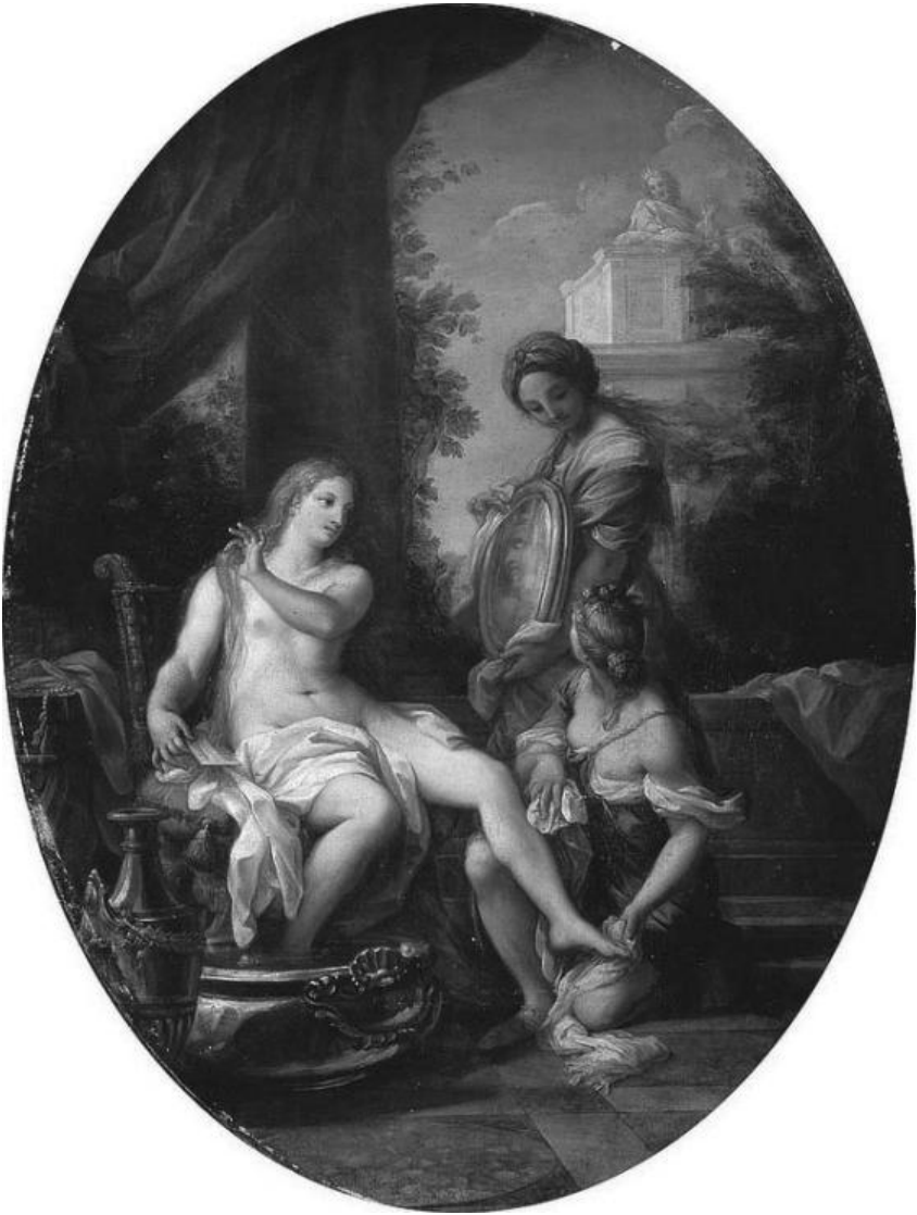
Figure 1.5. Carlo Maratti, David and Bathsheba .

the act of looking. She thus not only colludes with but also participates in making herself the object of the voyeuristic gaze. This is most striking in the seventeenth-century painting by Carlo Maratti (Figure 1.5). Bathsheba gazes