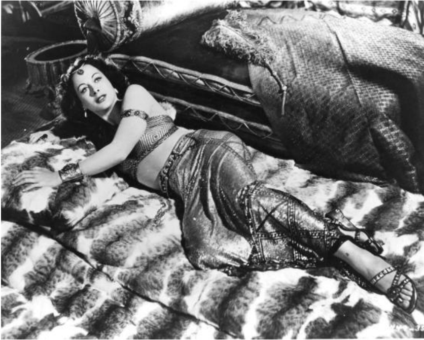
Figure 7.6. Hedy Lamarr as Delilah, in Samson and Delilah .

we are watching from a distance. 88 Through becoming more conscious of the film's mechanisms for masking the anxiety the femme fatale produces (investigation, fetishism), the female viewer can accept, and even enjoy, the illusion of the femme fatale for what it is.