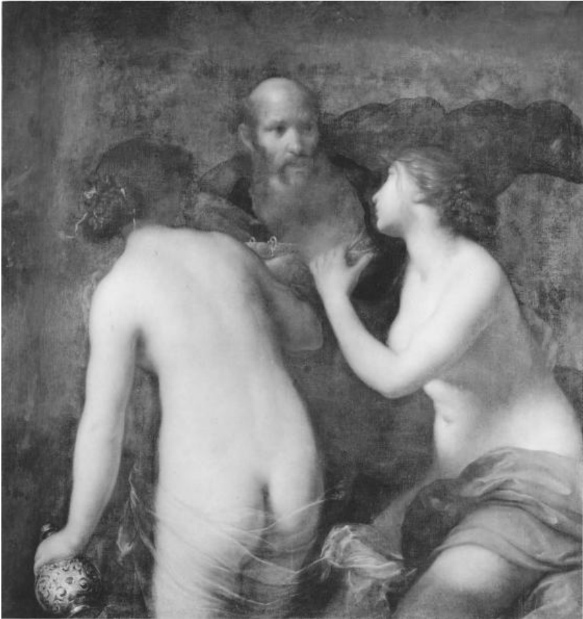
Figure 5.2. Francesco Furini, Lot and his Daughters , Museo del Prado, Madrid.

her back to us is completely naked, except for the most translucent of cloths barely draped around her buttocks and thighs; the one turned toward us has a dark cloth covering her genitals, while her left arm conceals one of her breasts from the viewer but not from Lot, with the other only dimly visible. Since we are dealing with a painting by a man presumably done for a male patron and male spectators, we can reasonably assume that the women's nakedness is for the pleasure of the male spectator-owner. 47 But their nakedness also accuses their father, for in addition to signalling their guilt, it also communicates and explains Lot's desire.