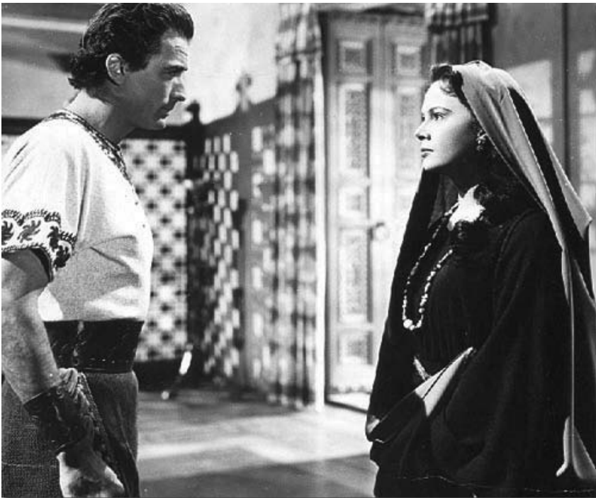
Figure 2.1. Gregory Peck and Jayne Meadows, in David and Bathsheba .

In her first appearance in the film, Michal wears drab (blue and black), rather bulky clothing that is unflattering and a far cry from Susan Hayward's low-cut, well-fitting outfits (Figure 2.1). Her head is covered in an unbecoming way (Hayward's usually is not, and when it is, her face and hair are carefully exposed). Unlike Hayward the star, who plays Bathsheba and whose