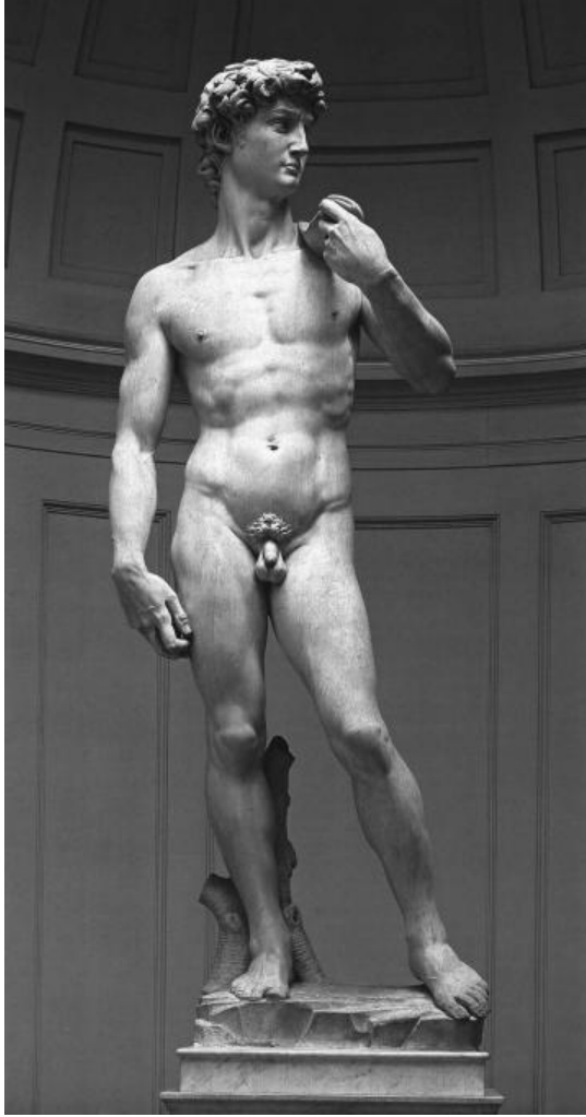
Figure 1.15. Michelangelo, David , Galleria dell'Accademia, Florence.

as well as in the Western philosophical and literary traditions. And the value given to the visual in any realist tradition responds to the desire to know the world: it promotes the gaze as the inspection of reality. 51