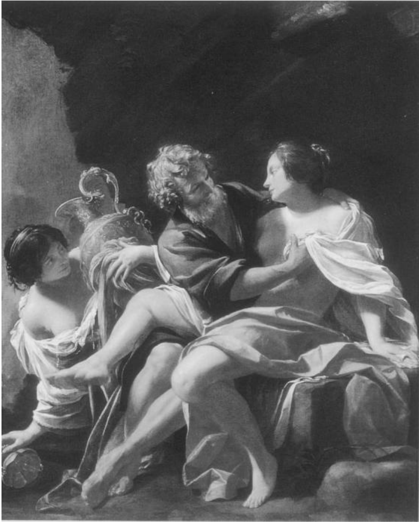
Figure 5.4. Simon Vouet, Lot et ses filles , Musée des Beaux Arts de Strasbourg.

apart. It would seem, then, that the artist defends Lot even while accusing him, which calls to mind the way the biblical Father put up defences against his unconscious incest wish in Genesis 19.