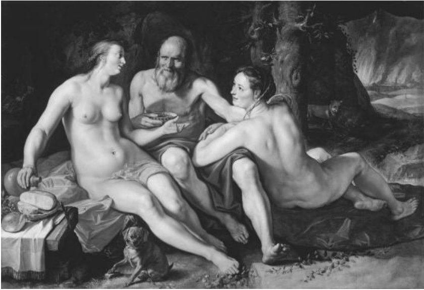
Figure 5.3. Hendrick Goltzius, Lot en zijn dochters , Rijksmuseum, Amsterdam.

younger daughter has given him, and his ruddy cheeks suggest this may not be his first cup (or is he flushed with excitement?). He is sitting up, hardly overcome by wine, and clearly having a good time. The display of female sexuality and the old man's lecherous posture toward the young women in this painting seem designed to titillate. By making Lot an active participant whose delectation is obvious, Goltzius conspicuously exhibits the incestuous desire that, owing to the Father's defences in Gen. 19.30-38, was unable to express itself except in a distorted shape.