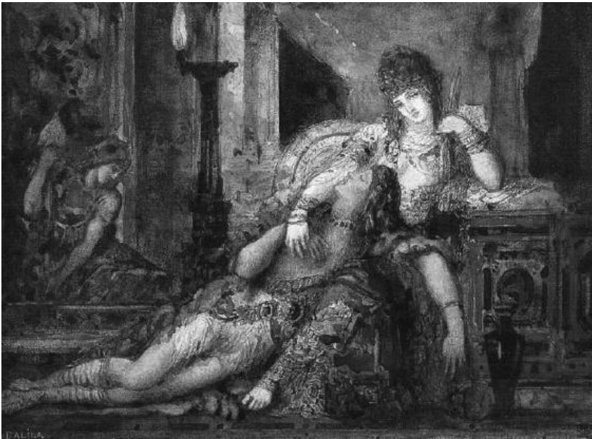
Figure 7.2. Gustave Moreau, Samson and Delilah , Musée Gustave Moreau, Paris.

Since Samson is not portrayed in the painting, we might ask, Is this before or after the betrayal? Perhaps it is before, and we should imagine that Delilah is waiting for him, possibly even plotting how to discover his secret. If so, does Moreau want to underscore her greed (for she appears well enough provided for by her admirers not to need the money she will receive for betraying Samson)? In another painting by Moreau (Figure 7.2) Delilah is similarly portrayed in an opulent setting, this time with a languorous Samson draped across her lap in an intoxicated slumber. In this painting, too, the temptation to condemn the femme fatale as avaricious is great, for she is already wealthy enough. On the other hand, could it be that greed plays no role whatsoever? Does the painting in figure 7.1 suggest that betraying a man is simply something this kind of woman would do, that it is simply in her nature as femme fatale ? If we take the painting to represent a time after the betrayal rather than before, then perhaps Delilah's opulent apparel is a sign of her ill-gained wealth. If she is contemplating the foul deed she has done, it is without the slightest trace of remorse, much like some of Moreau's paintings of Salome contemplating the head of John the Baptist. Regardless of whether the betrayal has already taken place or soon