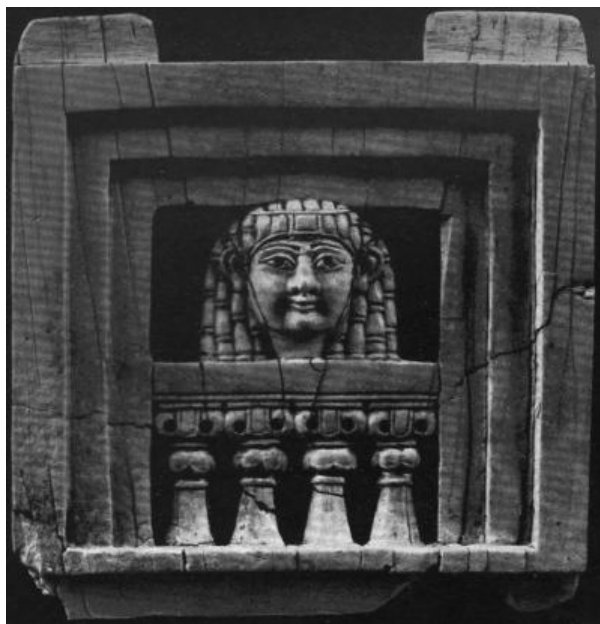
Figure 2.3. Woman at the Window , National Museum of Iraq.