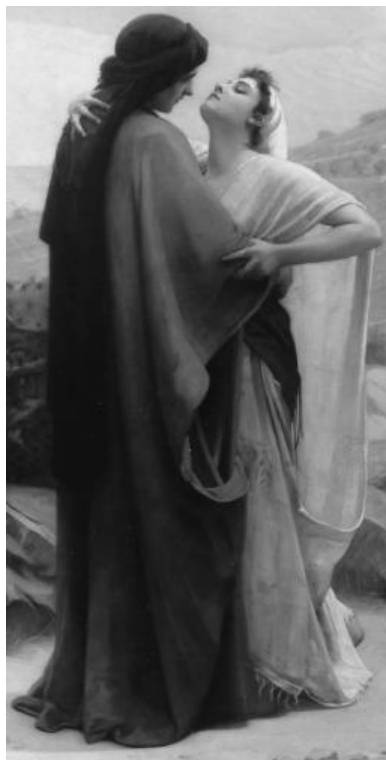
Figure 6.2. Calderon, detail.

the scene painted by Calderon as Naomi's taking leave of her daughters-in-law. These terms invoke a certain kind of competence that is required to make this identification; specifically, sufficient knowledge of the painting's source text to identify the event represented in the painting with a particular event in the story. Familiarity with High Victorian painting and its conventions, especially the Classical revival of the 1860s, will also help (Calderon's painting was voted the best religious picture of the 1886 Royal Academy Exhibition). But as Mieke Bal demonstrates so forcefully in her study, Reading 'Rembrandt' , this kind of competence, while offering a powerful interpretative tool, also exercises a powerful control over interpretation. By providing a programme of how to analyse a work of art, it encourages us to interpret within established parameters and thus can prevent us from noticing details that do not fit and from exploring alternative interpretations. 4 Certainly the scene from the book of Ruth in which Ruth 'clave unto' her