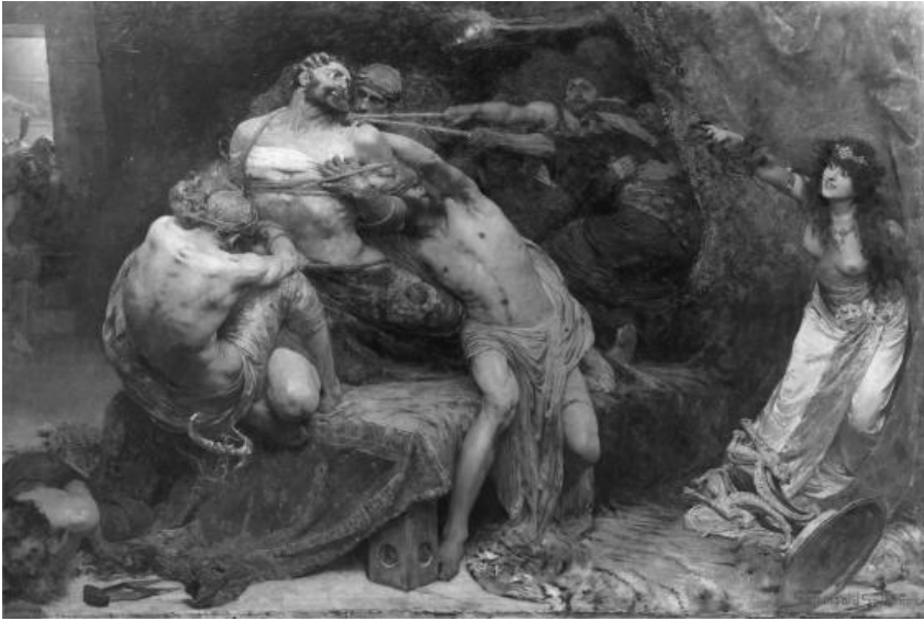
Figure 7.5. Solomon Joseph Solomon, Samson , Walker Art Gallery, Liverpool.

The British artist Solomon Joseph Solomon, in a painting dating from around 1886 or 1887, also gives us a Samson and Delilah in a bordello setting, where, once again, the evidence indicates that the couple has made love (Figure 7.5). There is a great deal of erotic energy in this painting, not just in the femme fatale 's pose and the muscular torso of Samson but also in the taut bodies of the men who are straining to restrain him. Why they too are so scantily clad is not clear (except, perhaps, to give the artist the opportunity to demonstrate his skill in representing anatomy). Should we take them as bordello patrons as well, or as the ambushers of Judg. 16.9 and