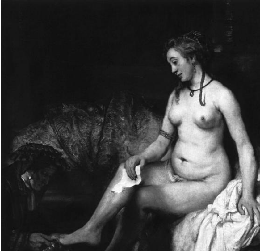
Figure 1.1. Rembrandt, Bathsheba at her Bath , The Louvre.

David. I cannot help thinking if she has had time to be seen by David and receive the letter and still has not put her clothes on, she must spend a good deal of her time naked.