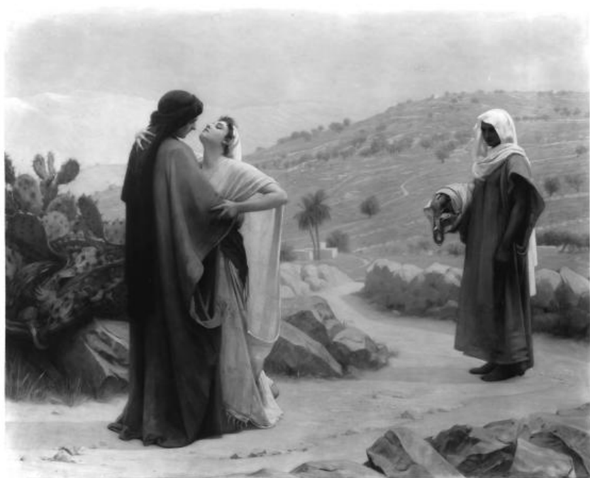
Figure 6.1. Philip Hermogenes Calderon, Ruth and Naomi , Walker Art Gallery, Liverpool.

only the same initial information I had: the painting's subject is the book of Ruth. So far, opinion is fairly evenly divided between those who think the figures embracing each other are Ruth and Naomi and those who identify them as Ruth and Boaz. In favour of the identification of the figure in black as Boaz are the facts that he is significantly taller than Ruth; his clothing, both the long-sleeved robe and the more elaborate headdress, is different from the women's; and—the strongest argument—the figures appear to be locked in a romantic embrace. Indeed, Ruth, who is dressed in white like a bride, has what could be called a look of rapture upon her face. Who, then, is the figure in blue to the side? A servant? She alone carries what appear to be provisions. Is this Naomi? 'Naomi' was the answer I most often received from viewers who take the central figures to be Ruth and Boaz. Naomi, who observes the match she has made, is now tangential, if not quite left out of the picture. This answer and its implications, I think, are suggestive, though if one looks at the original painting and not a reproduction, this woman seems rather young to be the other's mother-in-law. Another possibility is that she is Boaz's wife—thus filling a gap already perceived by the rabbis and echoed in modern commentary. No wife is mentioned in the story, but is it