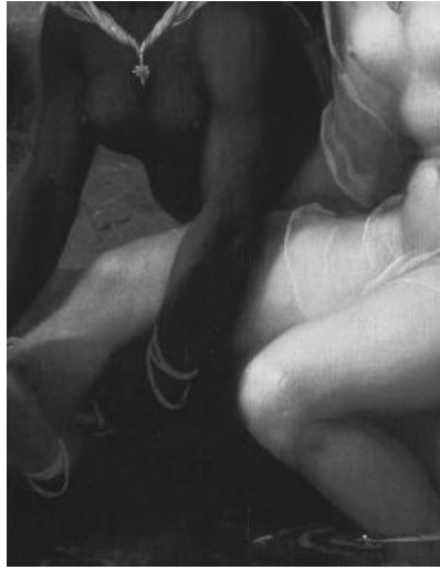
Figure 1.4. Van Haarlem, detail.

otherness and the exotic of which the woman is already an example. The black attendant is positioned as the dark place between the two pale figures. As representative of the new, mysterious dark continent that fascinated Europeans of the time, she symbolizes the dark and dangerously seductive mystery of woman. Her left arm is between Bathsheba's knees, and the effect of the shading and the shadows caused by the black arm against the black body is to give this arm the appearance of being thicker than the other (Figure 1.4). We might therefore see the arm as a fetish, a phallus substitute that serves to mitigate woman's threat. Bathsheba's gaze seems to be directed at this enlarged foreign body between her legs. Female sexuality is simultaneously displayed and rendered less threatening by means of the kitschy fountain in the form of a naked woman with water spewing asymmetrically from her breasts. The fountain serves also as a foreshadowing of Bathsheba's motherhood, which will neutralize her sexual threat. 35