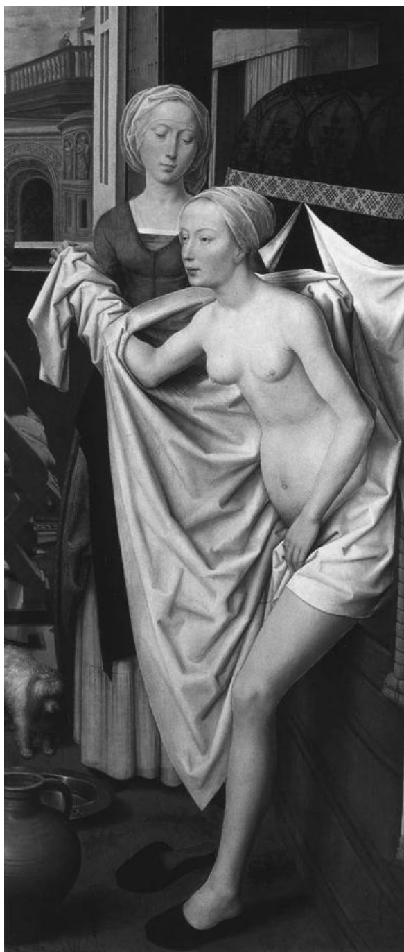
Figure 1.2. Hans Memling, Bathsheba im Bade , Staatsgalerie Stuttgart.