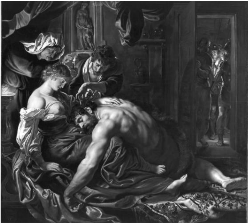
Figure 7.3. Peter Paul Rubens, Samson and Delilah , The National Gallery, London.

Two paintings by Rubens also perpetuate the image of Delilah as prostitute. In neither of them is she surrounded by the decadent opulence of Moreau's Delilahs, but rather she looks as if she could use the money the Philistines offer her. In Samson and Delilah in the National Gallery in London (Figure 7.3), Delilah appears as a young prostitute in a rather tawdry brothel, whose dim lighting barely camouflages the dingy brown walls. Among the rather stock furnishings (a flaming brazier, heavy curtains, and a patterned Oriental carpet), a statue of Venus and Cupid in an alcove provides a bordello atmosphere. An old madam looks over Delilah's shoulder and holds a candle for the barber, who deftly snips off Samson's hair while he sleeps, apparently exhausted after spending his passion in arduous love-making. Amid the warm, rich hues that lend to the painting a feeling of sensuality, the stark whiteness of Delilah's face, shoulders, and large breasts catches the viewer's