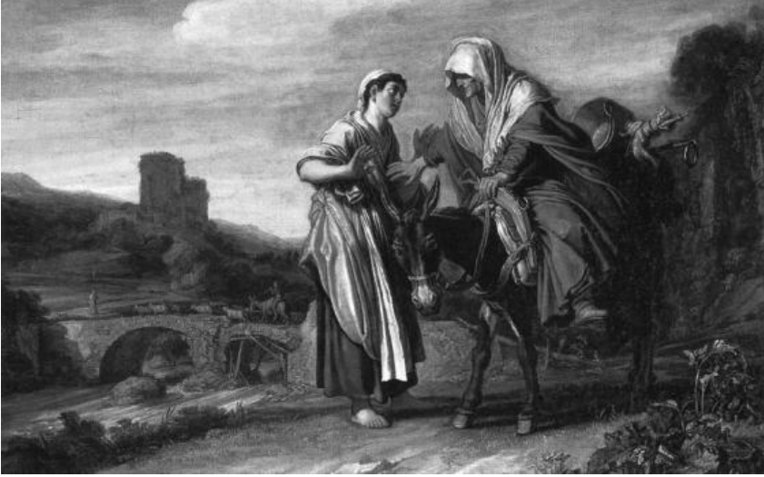
Figure 6.4. Pieter Lastman, Ruth Swears Loyalty to Naomi , Niedersächsische Landesgalerie, Hannover.

(dated 1614) Naomi is an old crone sitting on a donkey, pushing away a young, appealing Ruth (Figure 6.4).