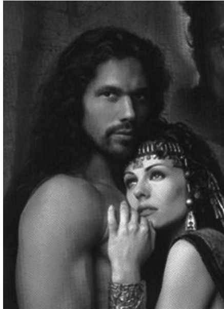
Figure 7.7. Eric Thal and Liz Hurley as Samson and Delilah.

actors. 92 Not that the actors are particularly convincing, or even interesting. Dennis Hopper is miscast as the Philistine General Tariq, whose boredom with the company in ancient Gaza could easily be mistaken for boredom with the role, while Eric Thal is a rather insipid Samson, confused about the meaning of his life (but, then, Victor Mature was rather bland, though not troubled by existential doubts). But it is Liz Hurley, as Delilah, who is most ineffectual, giving us a character who is unsympathetic and boring at the same time. Hurley's Delilah left me wondering at the lack of imagination in casting such a one-dimensional stereotypical femme fatale as the Delilah of the 1990s.