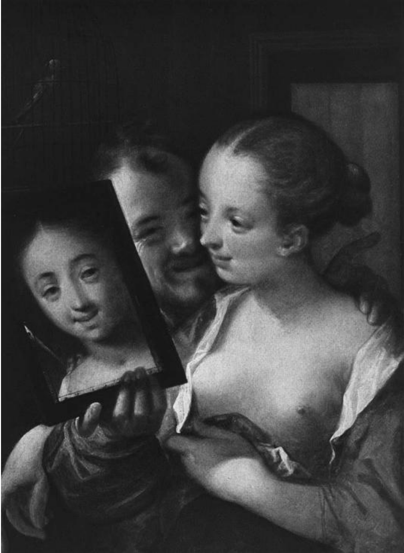
Figure 1.7. Hans von Aachen, Scherzendes Paar mit einem Spiegel ( Der Künstler mit seiner Frau ), Kunsthistorisches Museum, Vienna.

to the spectator. The artist, laughing, looks over her shoulder directly at the spectator. With one hand he holds the mirror, displaying his wife for the spectator's pleasure. His other hand rests on his wife's shoulder, and he wags his finger at the spectator in a knowing gesture, as if playfully (or mockingly) saying, 'I am offering this to you to enjoy, but shame on you for looking'.