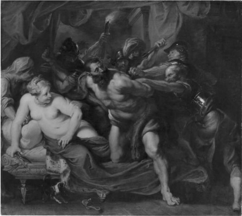
Figure 7.4. Peter Paul Rubens, Gefangennahme Simsons , Alte Pinakothek, Munich.

red bedclothes and curtains signify her profession. The old madam stands over her shoulder, and a dog and slippers, conventional symbols for sex, are in the foreground. It seems apparent from their positions on the bed and their state of undress that the couple has recently made love. Samson attempts to get up and 'shake [himself] free' from his captors, as in Judg. 16.20. Here even more of Delilah's fleshy flesh is exposed, though her left hand covers her genitals. Once again the woman's nakedness accuses her as 'loose' and as the activator of desire, and her ample white flesh, which as in Figure 7.3 sets her apart from the other figures in the painting, suggests perhaps a pampered life style. This Delilah is less sympathetic than the other. In this painting, she, and not a barber, has cut Samson's hair. She still holds the scissors in her hand. This makes it easier for viewers to hold her more accountable than the Delilah Rubens painted as watching passively and perhaps with regret. 25