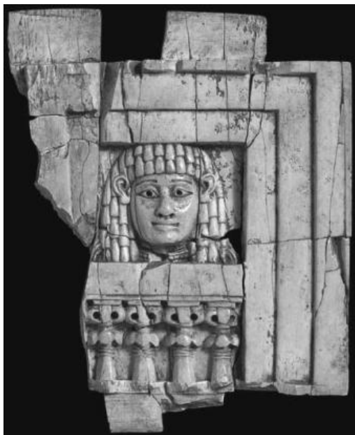
Figure 2.2. Woman at the Window , British Museum.