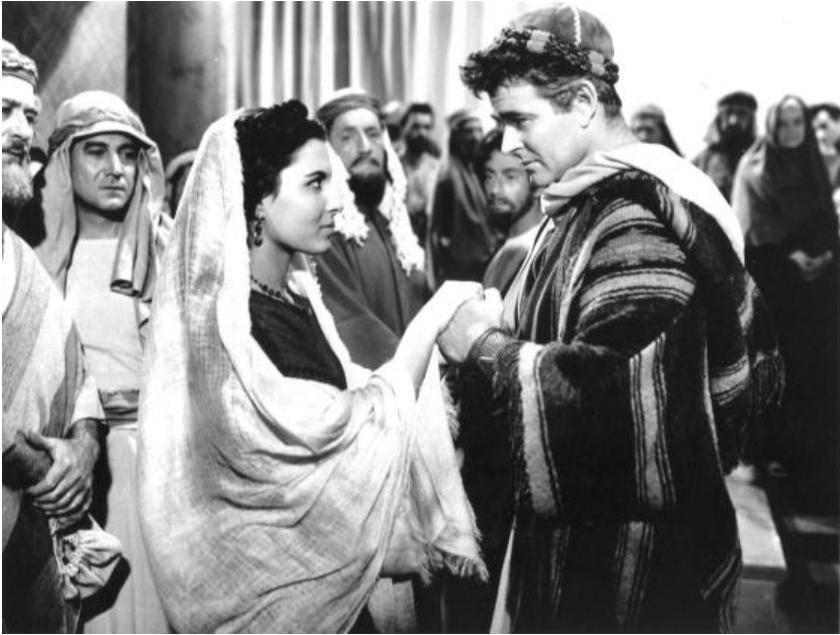
Figure 6.7. Elana Eden and Stuart Whitman, in The Story of Ruth .

In Hollywood's version of the story of Ruth, when the romantic relationship between Ruth and Boaz is foregrounded, it is at the expense of the bond between the women. Not only is Naomi too old and non-sexual to be a serious romantic interest for anyone, but also Ruth goes with her to Bethlehem for theological, and not personal, reasons. When it comes to affirming the heterosexual bond over the bond between the women, the film's crowning touch is achieved through the use of the musical score, composed by Franz Waxman, to signal the shift in Ruth's devotion. Early in the film, just after Ruth makes her famous entreat-me-not-to-leave-you speech, we hear her words set to music and sung by a female voice while we watch the two women journeying across the wilderness to Judah. The same musical theme is played again the moment Ruth says to Boaz, 'I love you'. As she leaves the threshing floor, it is to the tune of 'Where You Go I Will Go'. The music is repeated at the film's end, when Ruth and Boaz leave the screen as man and wife. By transferring the moving musical setting of Ruth's oath of loyalty from Naomi to Boaz, the film has managed not only to foreground the heterosexual bond but dramatically and effectively to replace the bond between the women with the romantic bond between a heterosexual couple. 115