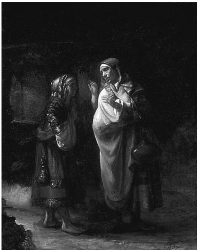
Figure 6.5. Willem Drost, Ruth and Naomi , Ashmolean Museum, Oxford.

for these viewers the erotic power of the Ruth–Boaz relationship is so self-evident that they assume the painting represents the artist’s vision of their relationship—a vision that finds its basis in the source text, but does not attempt to capture on canvas a particular scene from the source text. What is this basis? What features of the book of Ruth, apparent or latent, are such readers relying on to produce affirmations of opposite-sex relationships by constructing a romantic bond between Ruth and Boaz?