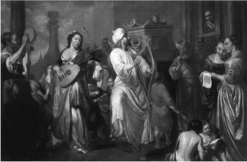
Figure 2.4. Jan de Bray, David Dances before the Ark of the Covenant , Evansville Museum of Arts and Science, Indiana.

of the woman at the window, there is a massive window frame, and the woman peering out, like her ancient Near Eastern counterparts, is out of proportion to the scene and the size of the building. Here we see the woman at the window and what she is looking at as well. She is both object and owner of the gaze. We look at her and strain to get a better glimpse and to make out the details of her face amid the shadows, and David looks self-consciously at her, thereby acknowledging the power of her gaze. Unlike the bathing Bathshebas in the paintings examined in Chapter 1, she looks back at David. The tension created in this painting between Michal's isolation in the upper right-hand corner and her domination of the scene as both focalizer of David and object of his focalization represents visually the tension in the biblical text between Michal's narrative confinement and her unsuccessful attempts to assert her autonomy.